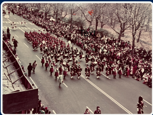
Photos: Macy's Thanksgiving Parade 1983

From 1983 to 1987, I played the bagpipes with the Queen's University Bands, proudly serving as Pipe Major for one season. Those years were filled with unforgettable memories and friendships. I still remember the excitement of following the football team through two Vanier Cup championships in addition to marching down the streets of Manhattan in the annual Macy's Thanksgiving Day parade. The music, the travel and the friendships forged in tartan and tradition left a lasting mark. Almost four decades later, I still enjoy playing in both military and contest pipe bands - both here and in Scotland.