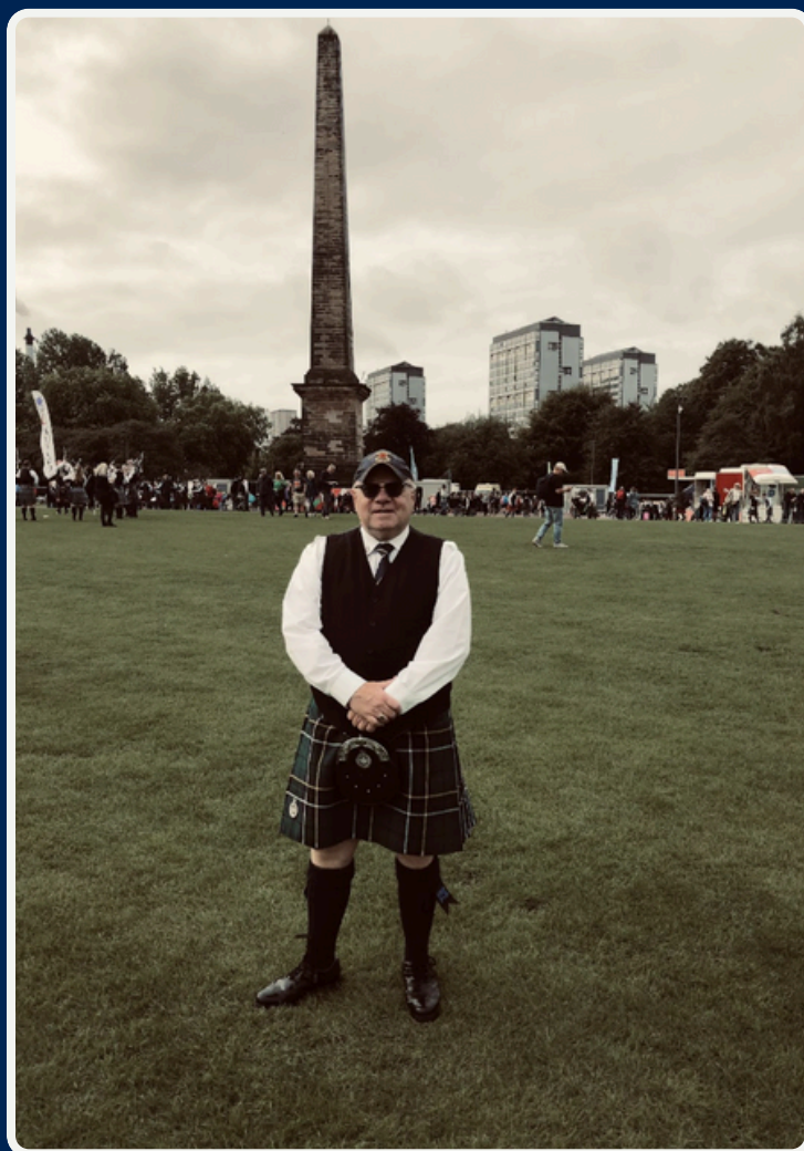
Photo: Glasgow, Scotland 2024

Even though many years have past since I was a member of the Queen's University Bands, the sound of the pipes still stirs memories performing at the pre-game and half-time shows, the late nights of marching practice at Richardson stadium, the many spirited parades, and the joy of representing Queen's with pride.